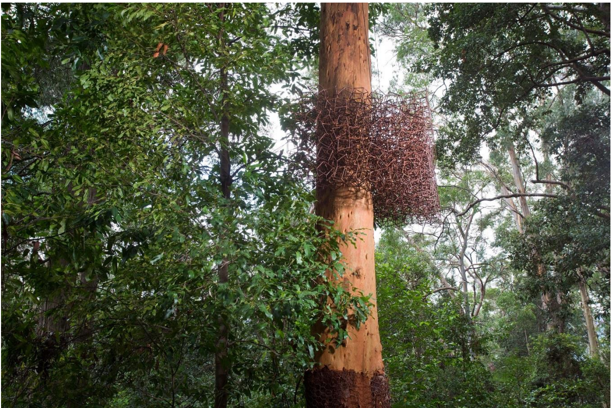
Jennifer Cochrane, Steel Stack with tree , 2015. Steel.