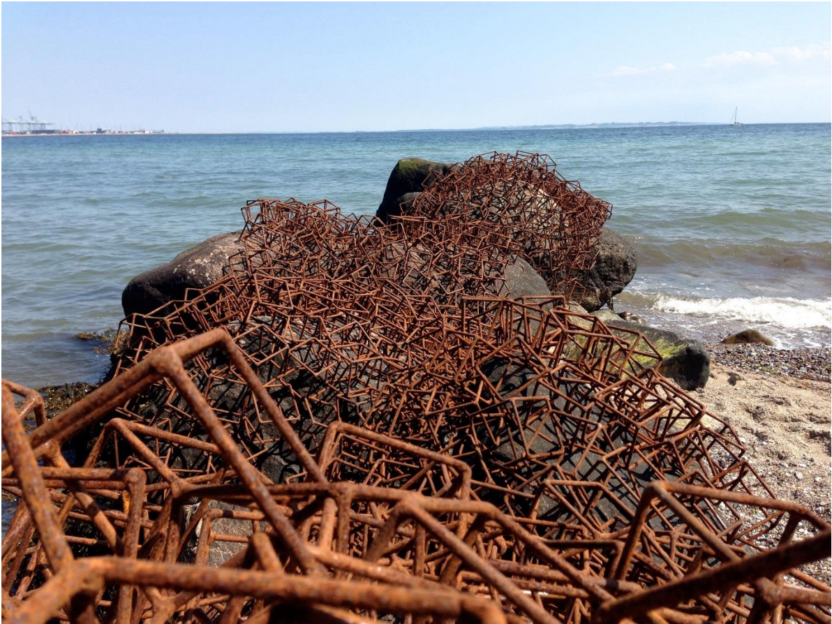
Jennifer Cochrane, Cube Stack 2 , 2013, Aarhus, Denmark. Steel, variable dimensions.